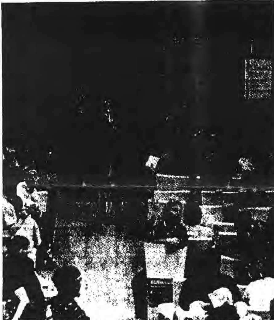
In June 1968, the SDS held its National Convention Plenary at the MSU Union. The result was an extremely drawn-out debate in pursuit of a unifying ideological policy.