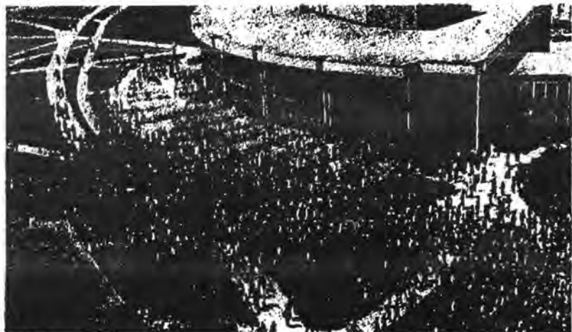
LEFT: An April 1966 Ramparts magazine cover story exposed MSU's ties with the CIA and the regime of Ngo Dinh Diem. ABOVE: Students assemble outside a dormitory at Michigan State University during student strikes following the Cambodian invasion and the shootings at Kent State in 1970.