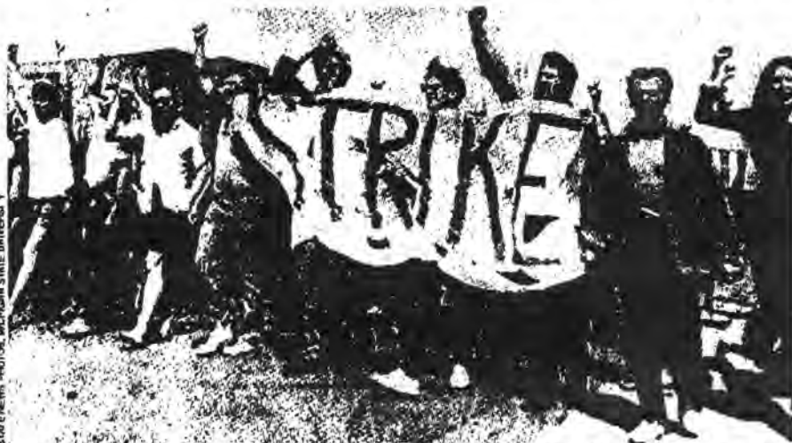
After rallying at Beaumont Tower, MSU strikers march past East Shaw Hall during the April 1970 strike—the largest student protest in American history.

This laundry list of radical concerns proved to be the undoing of the strike: some demands (such as withdrawal from Cambodia) were outside the university's power; other demands were soon seen as bones thrown to special-interest groups. While 12,000 students initially boycotted classes and the effort lasted for more than two weeks, support for the strike was paper-thin. Many strikers had never before participated in anti-war demonstrations. Furthermore, SDS members and other radicals turned