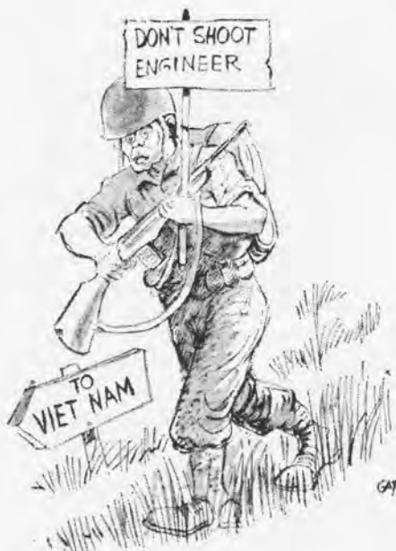
GAT IN THE MANILA CHRONICLE (MANILA)

So what does the Marcos administration do? It cannot wait to fight, not the Communists who have drawn a curtain of fear around three or four provinces right here . . . but Communists thousands of miles away, in a foreign country, in cities and towns whose names Filipinos cannot even pronounce. . . .