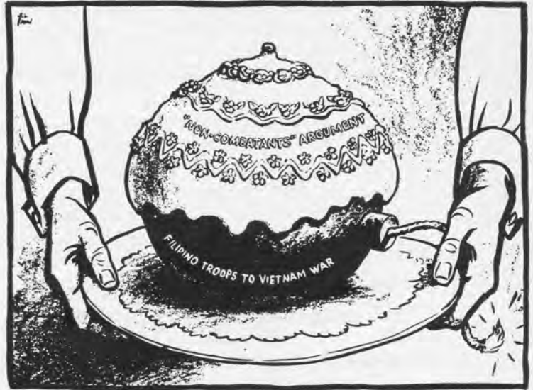
FROM PHILIPPINES FREE PRESS (MANILA)