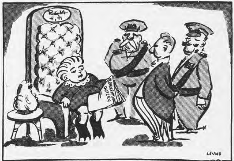
"Is that the best you can come up with.. ASBESTOS DRAFT CARDS?"